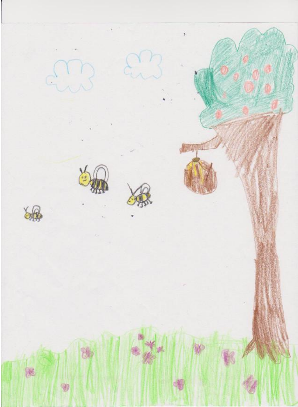
By Ojasi Niphadkar, Kindergarten